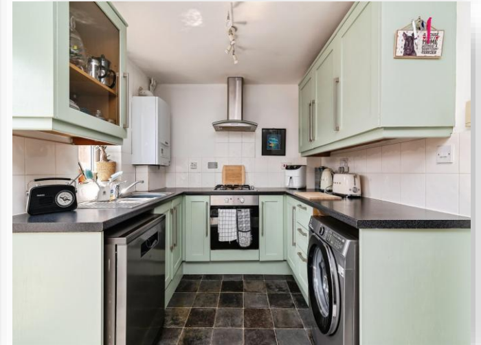
Mimosa Close, Nottingham NG11 8SP