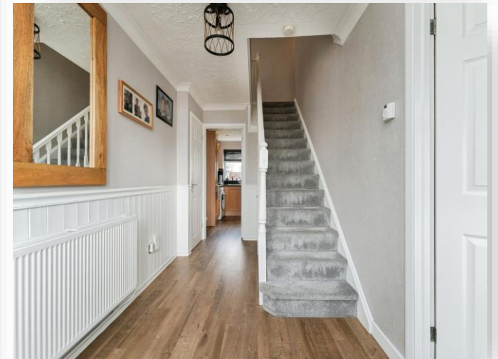
Brewin Avenue, March PE15 9SL