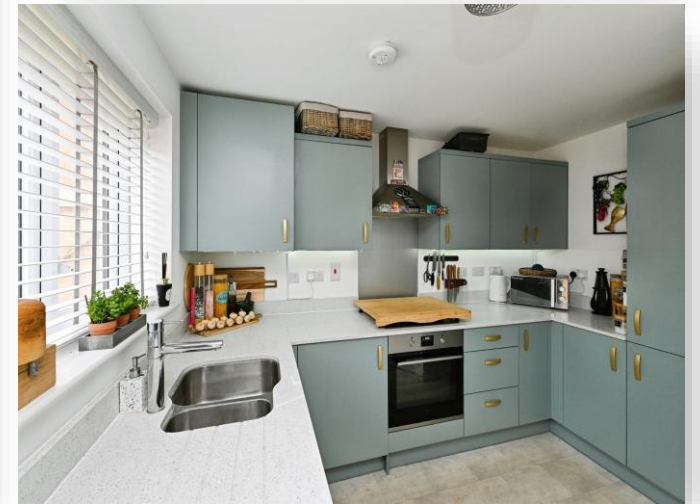
Daisy Drive, South Wootton, King's Lynn, PE30 3FR