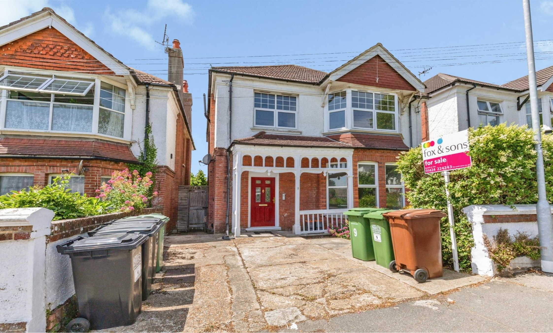
Elmstead Road, Bexhill-On-Sea TN40 2HP