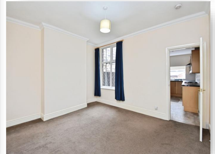
Burke Street, Harrogate HG1 4NR