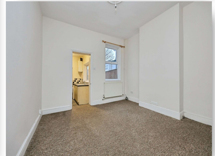
Wellington Road, Norwich NR2 3HT