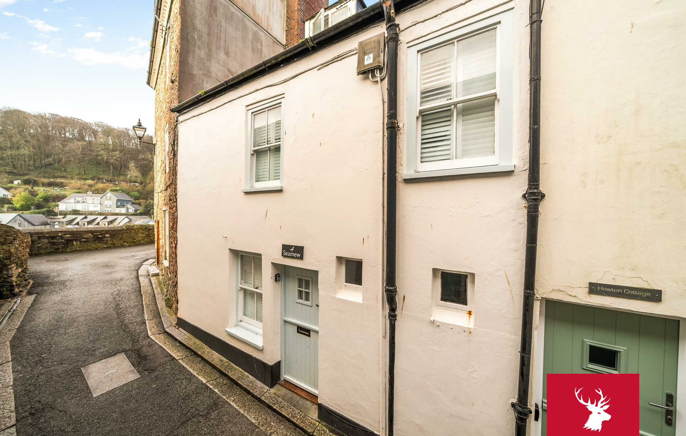
Seamew Garrett Street