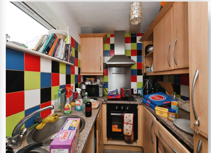
Berners Way, Broxbourne EN10 6NR