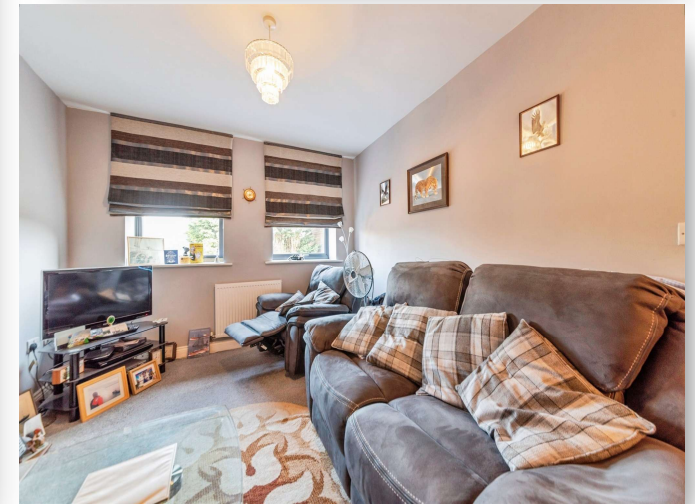
Apartment 12 Mill Gate Apartments Mill Gate, NG24 4TR