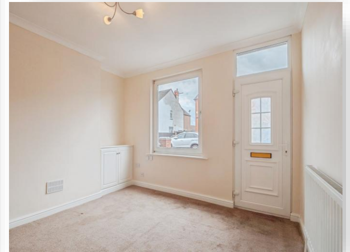
Bridge Road, COALVILLE