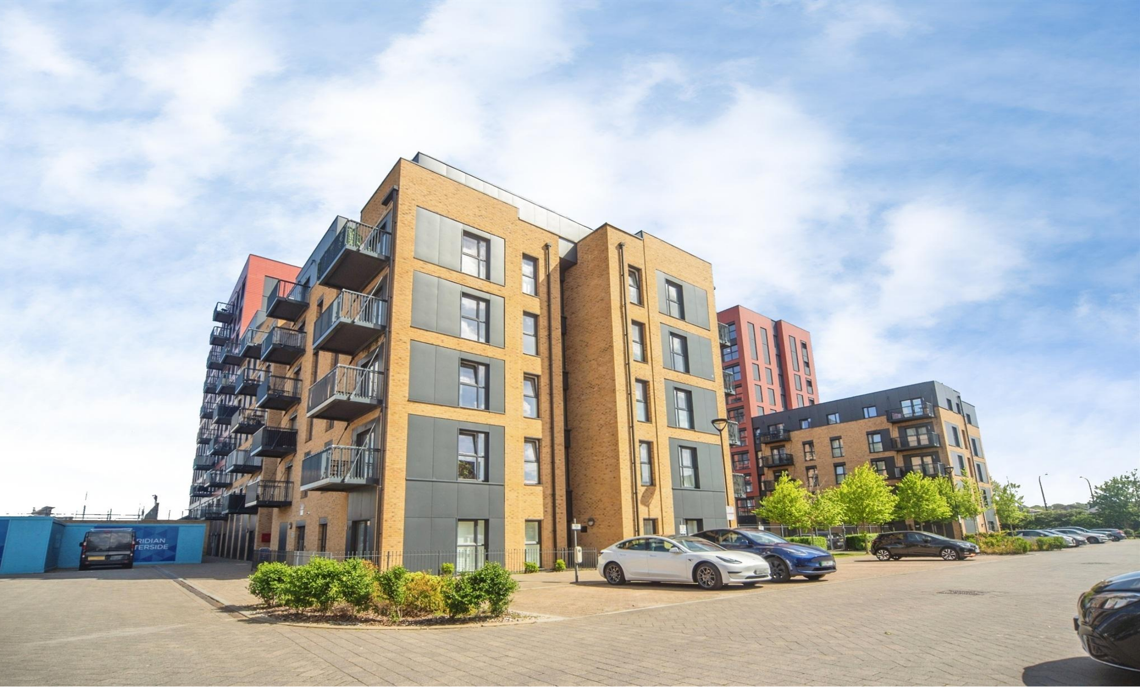
Granada House, Meridian Way, Southampton SO14 0FT