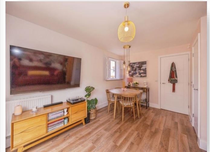
Clements Grove, Waterlooville PO8 9FF