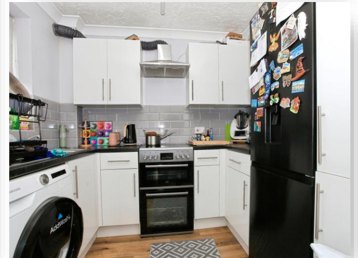
Langdyke, Peterborough PE1 4SS