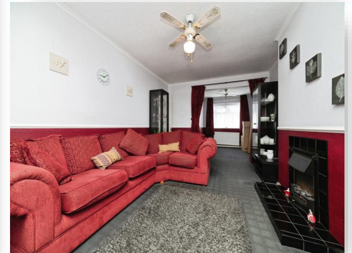
Queens Close, Cottingham HU16 4ER