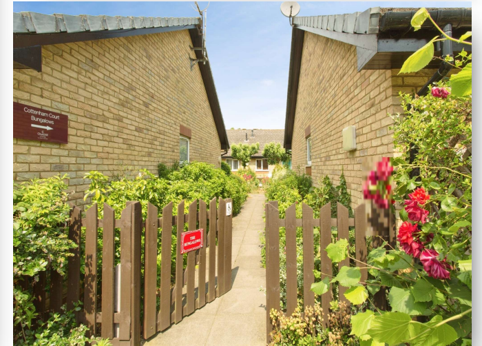
6 Cottenham Court, High Street, Cottenham, Cambridge, CB24 8GG