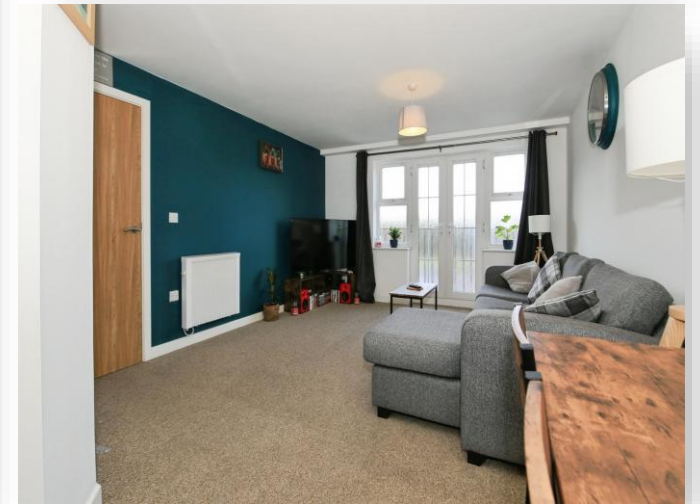
Church Street, Stanground Peterborough PE2 8GH