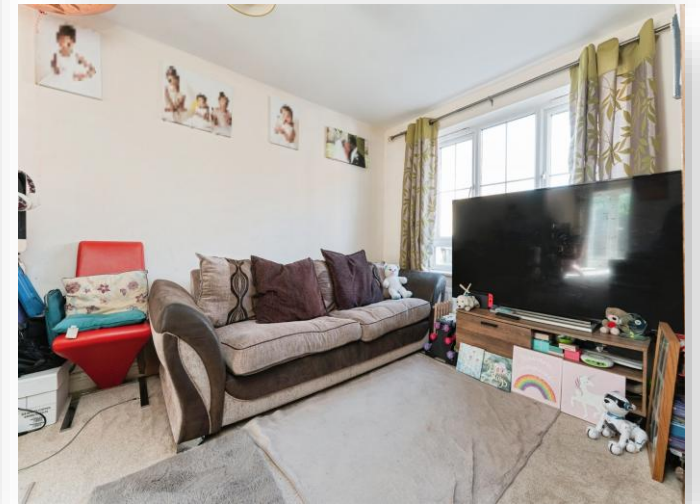
Allen Road, Ely CB7 4GR