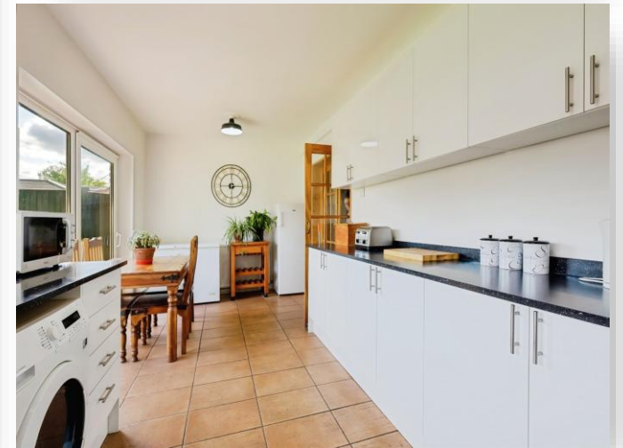
Irving Grove, Corby NN17 2BL