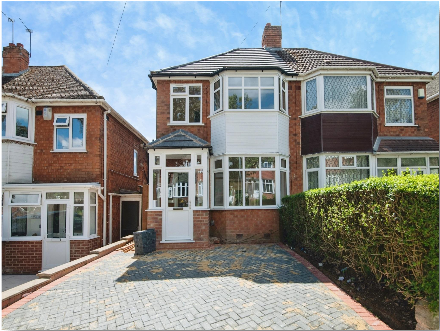
Wensleydale Road, Birmingham B42 1PJ