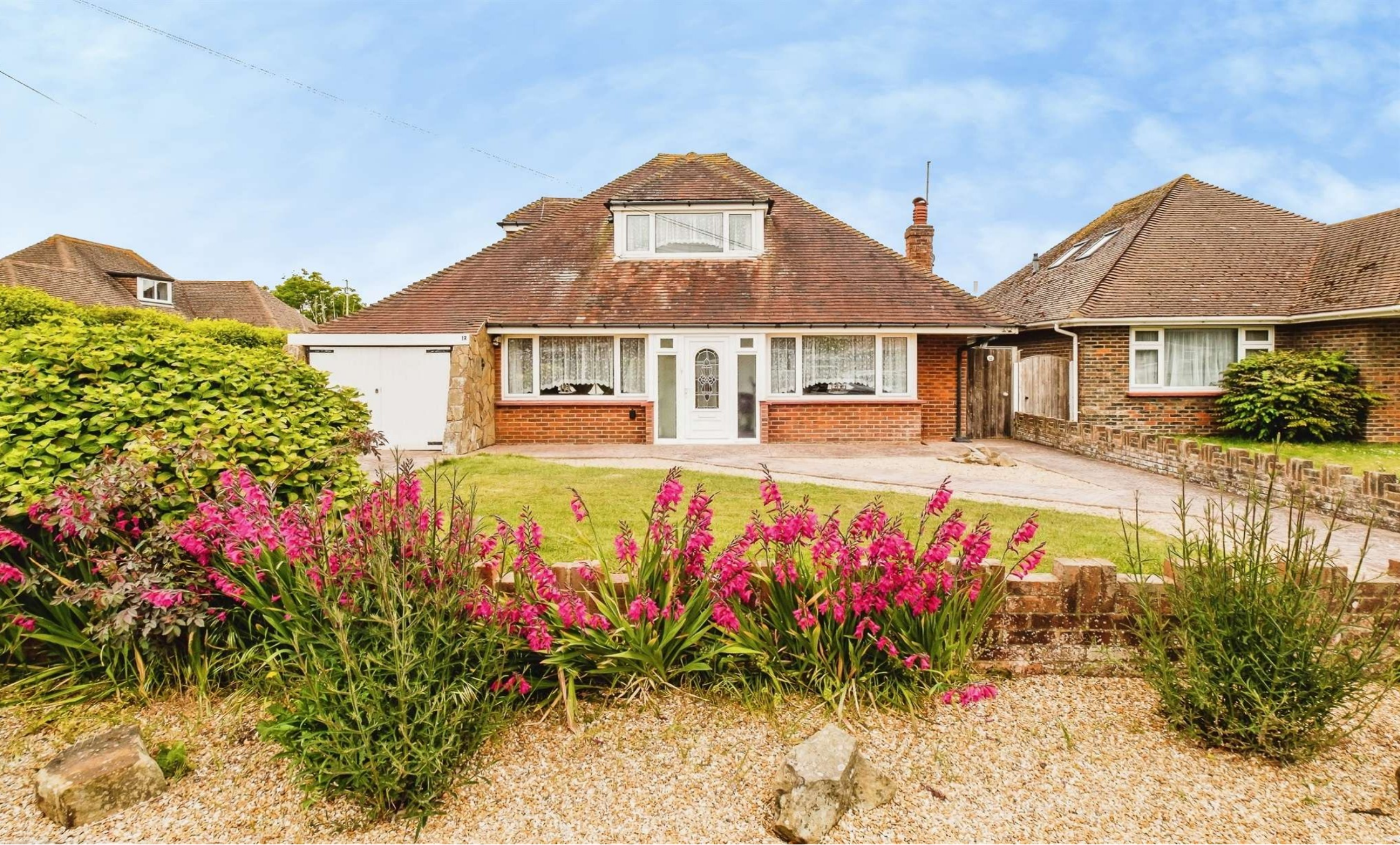
Beachside Close, Goring-By-Sea Worthing BN12 4JQ