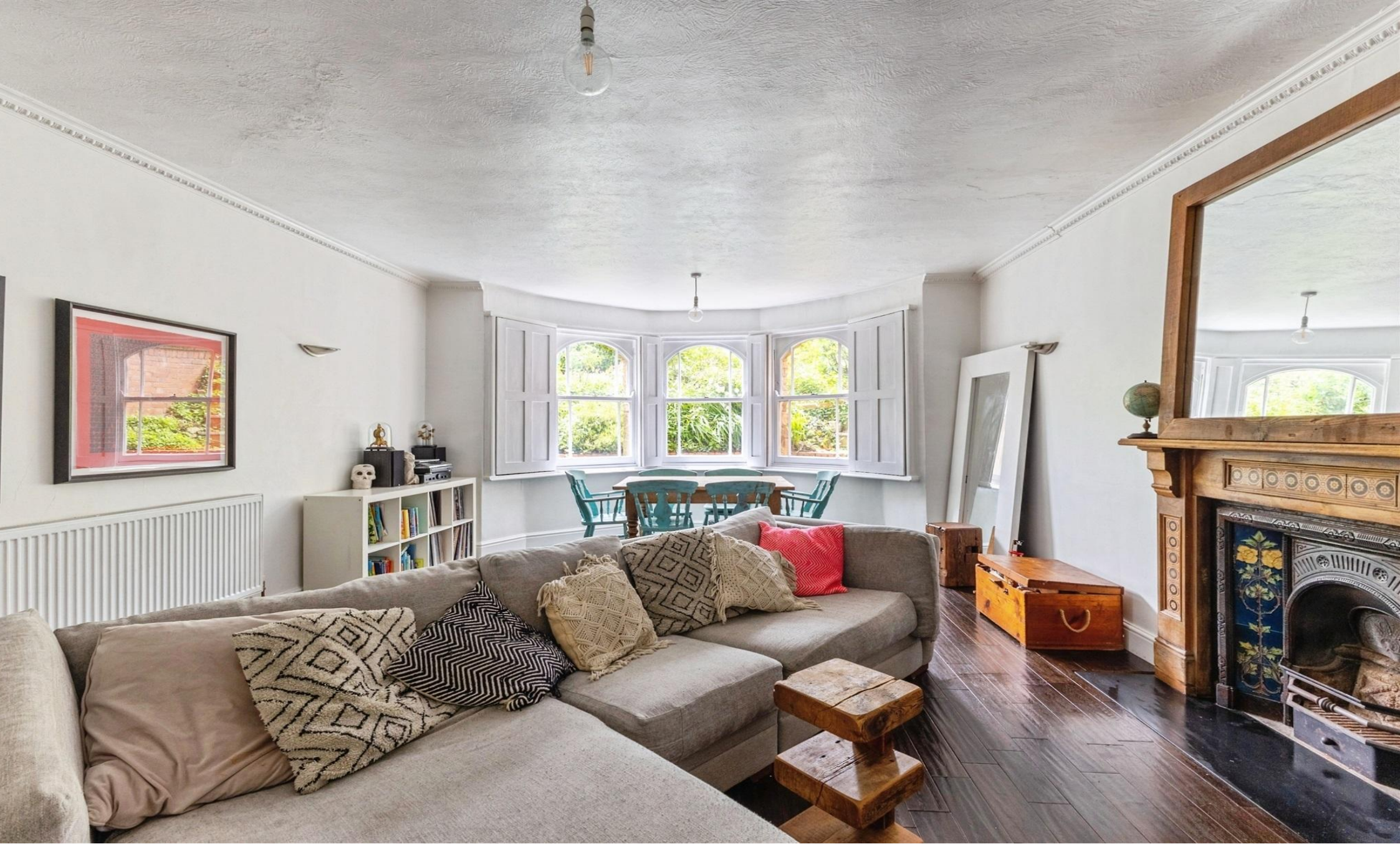
Pembroke Road, Clifton Bristol BS8 3ER