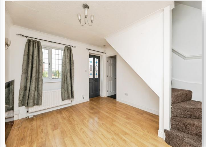
School Street, Churwell LEEDS LS27 7SQ