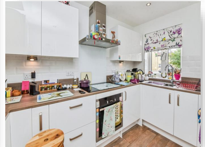
The Old Nurseries, Frome, BA11 4FH