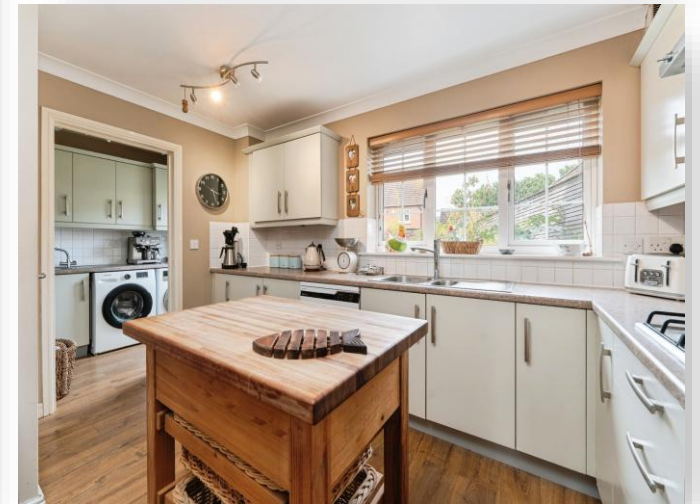
The Furrow, Littleport CB6 1GL