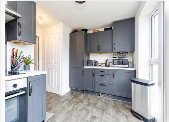
Hitchcock Gardens, Wynyard Billingham TS22 5JU