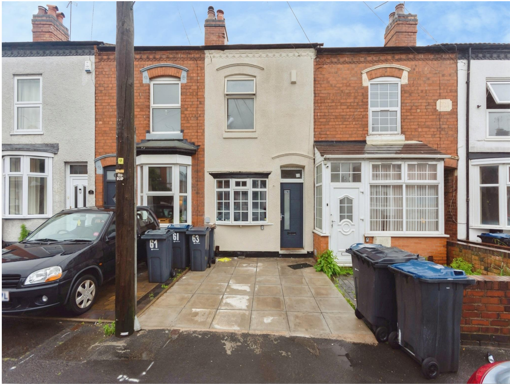
Northfield Road, Harborne Birmingham B17 0ST