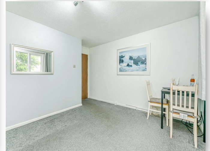
Harlequin Court Newport Road, Roath Cardiff CF24 1RE