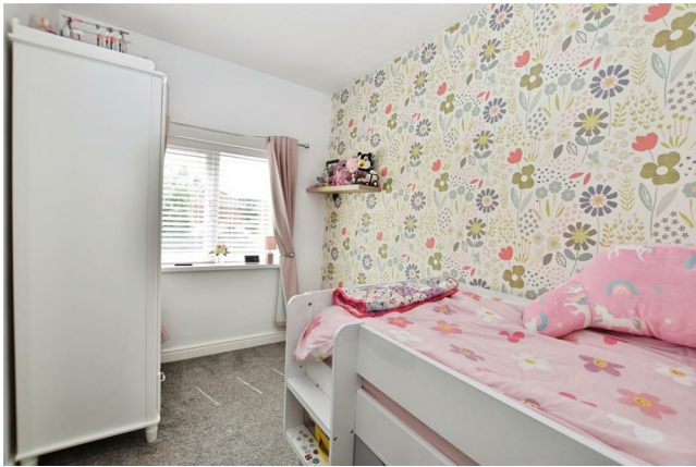
Bedroom Three 11'11 x 7'0 (3.63m x 2.13m)

Upvc double glazed window and central heating radiator