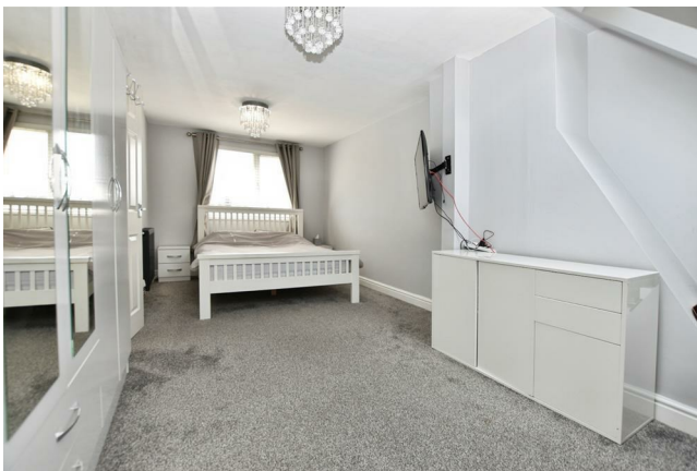
Master Bedroom 17'9 x 10'8 narrows to 8'11 (5.41m x 3.25m narrows to 2.72m)

This room was formally two bedrooms, with the doorway still in place to enable it to be converted