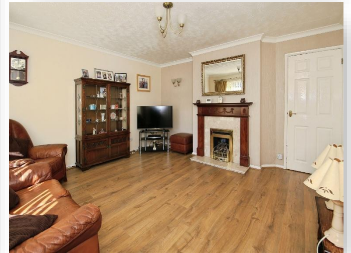
Glenton Street, Peterborough PE1 5HH