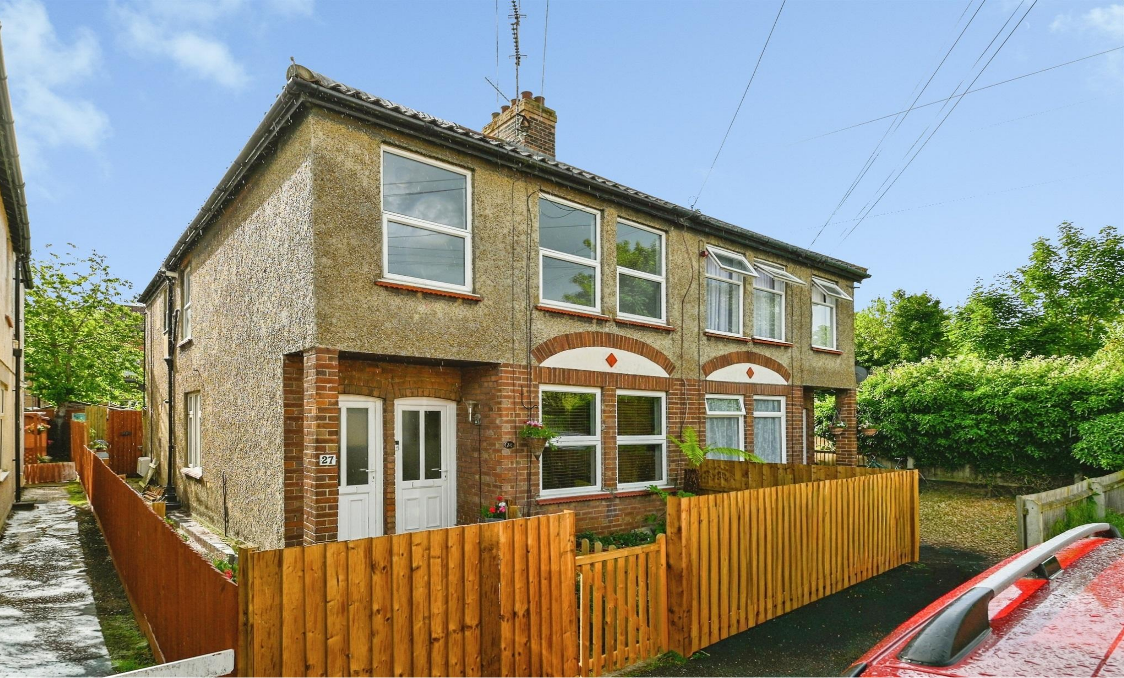
Harecroft Gardens, King's Lynn, PE30 2BY