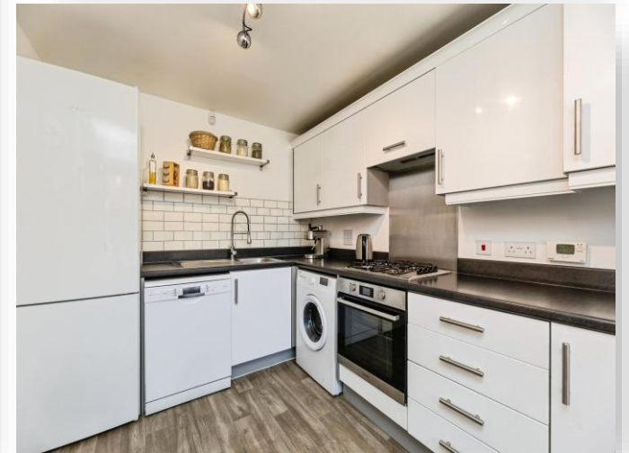
Peart Place, LEEDS LS10 4FR