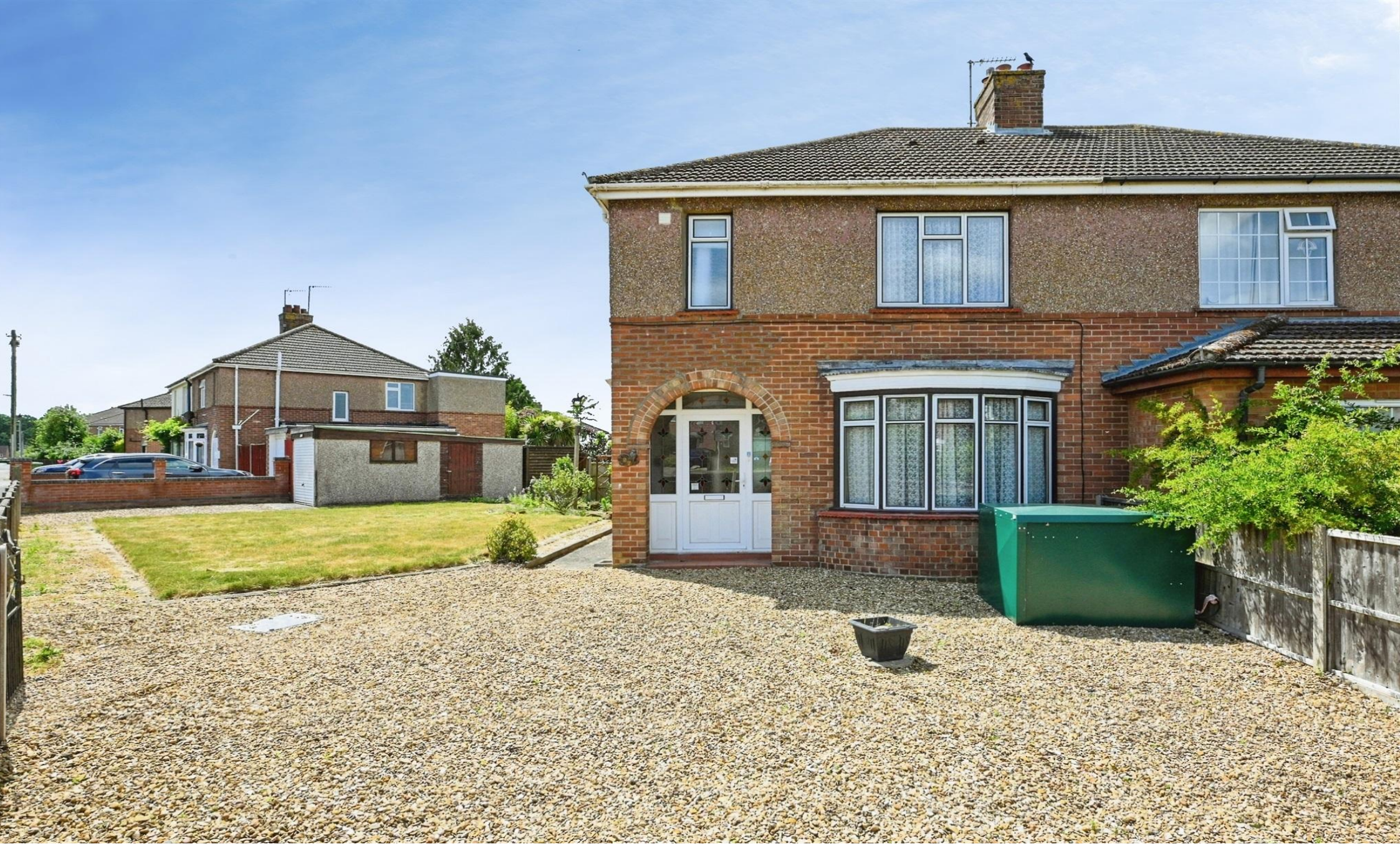
Kent Road, King's Lynn, PE30 4AU