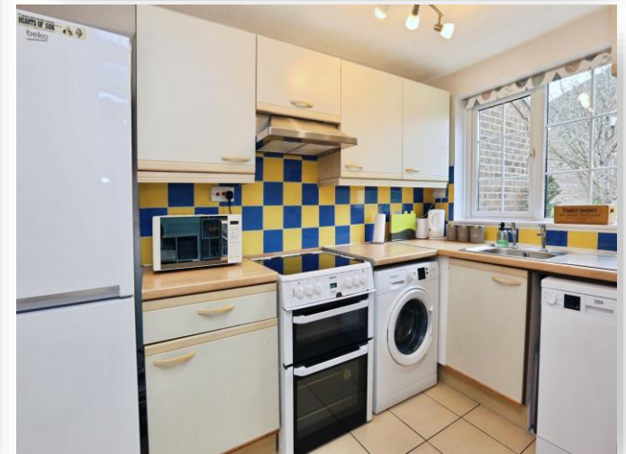
Cosford Close, Bishopstoke, Eastleigh. SO50 8PQ