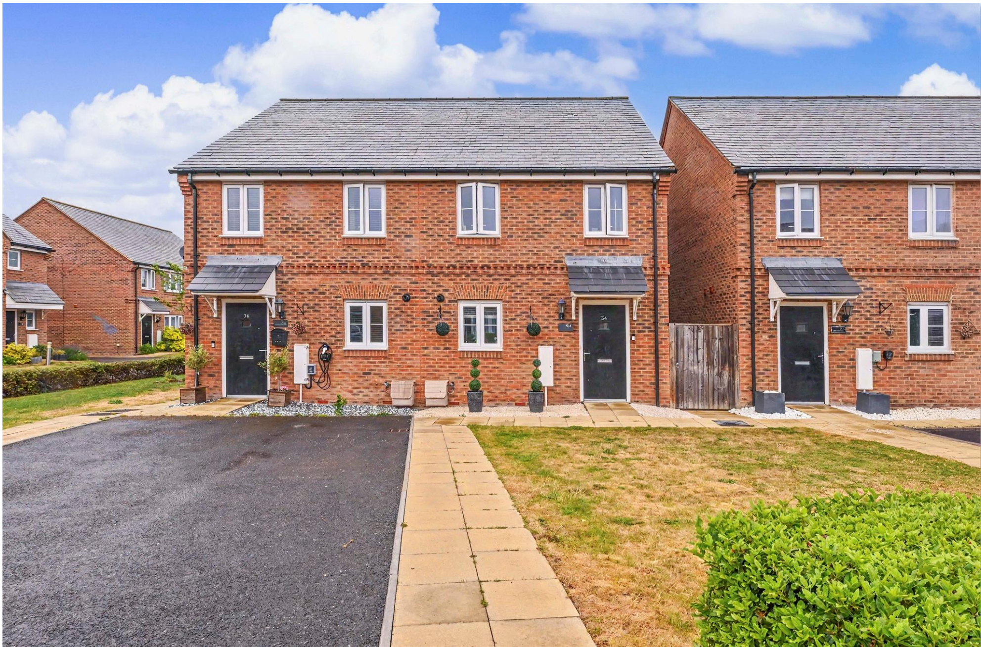
Waring Crescent, Aston Clinton Aylesbury HP22 0AB