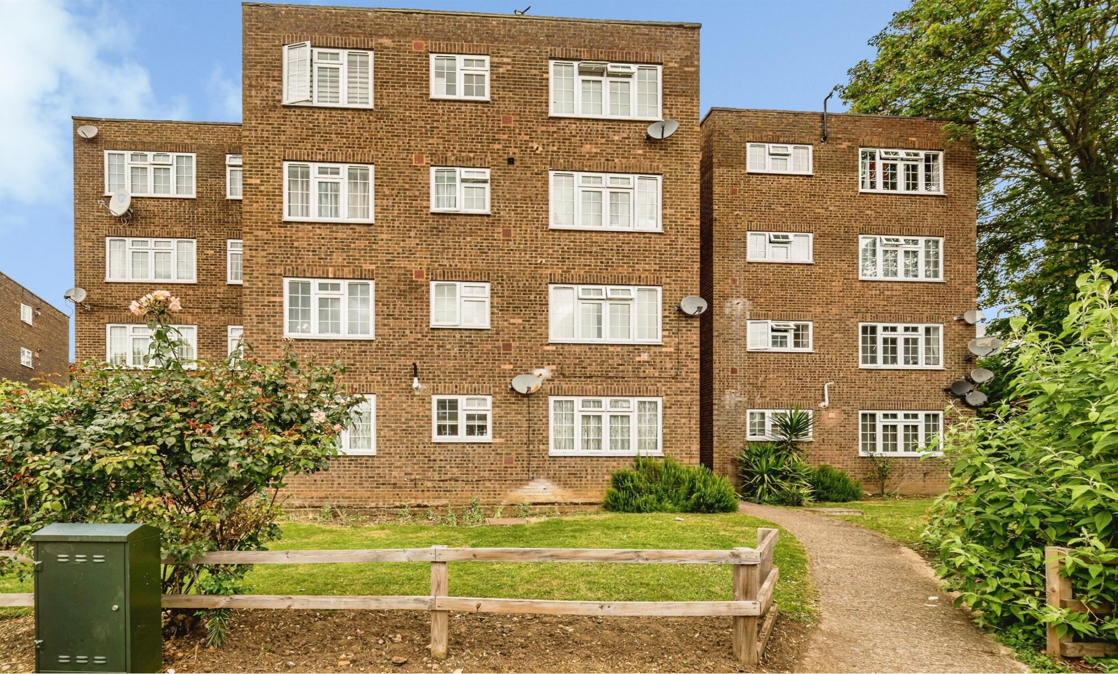
Arborfield Close, Slough SL1 2JP