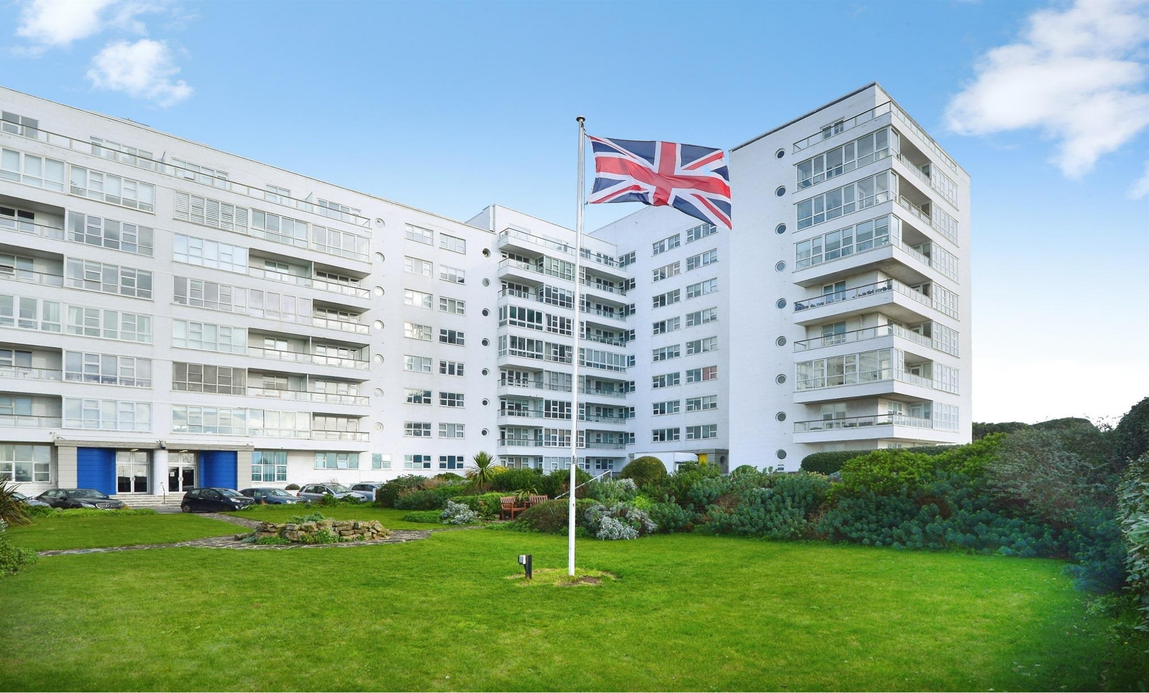
Marine Gate, Brighton, BN2 5TQ