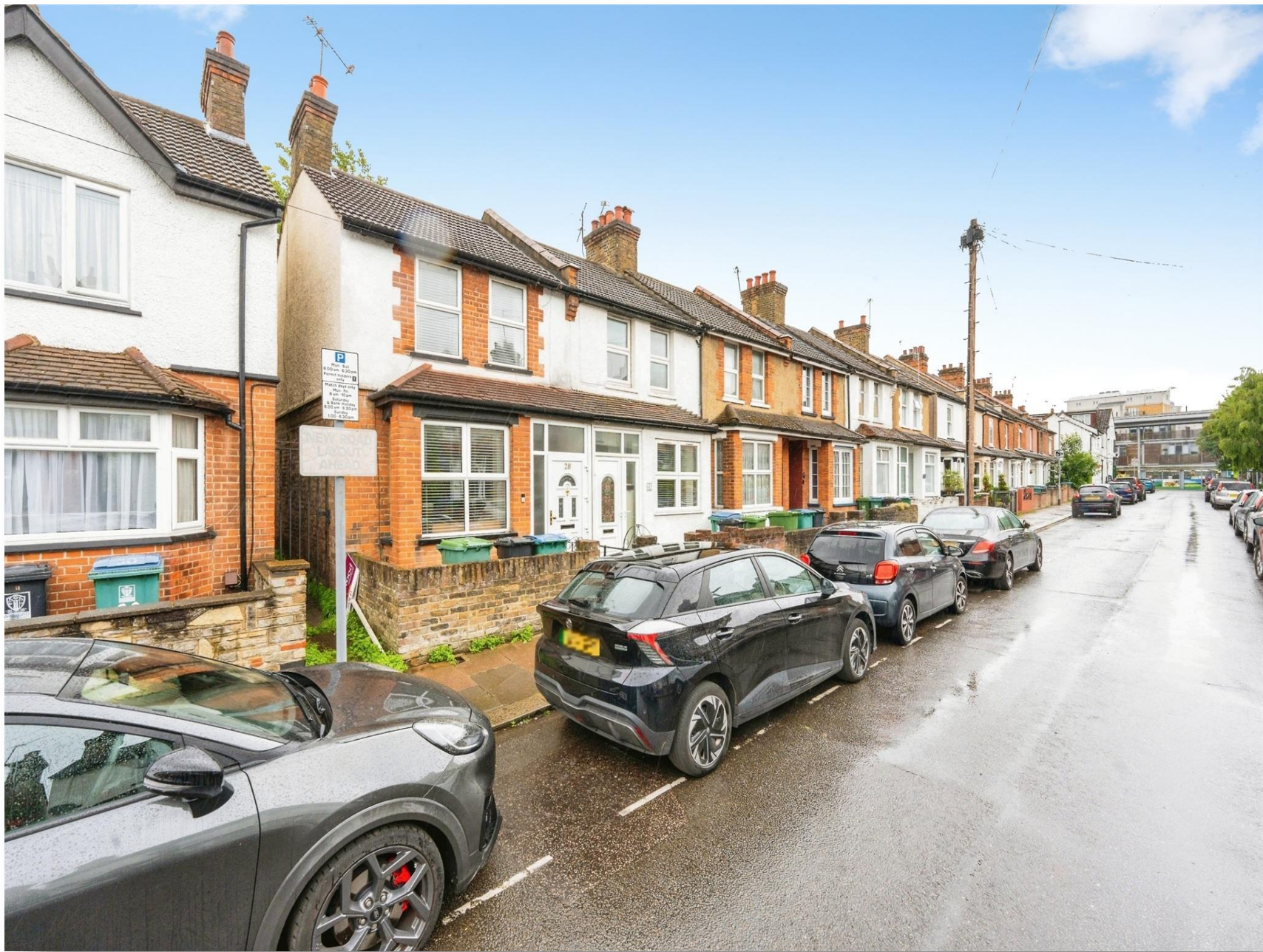
Cassiobridge Road, Watford, WD18 7QL