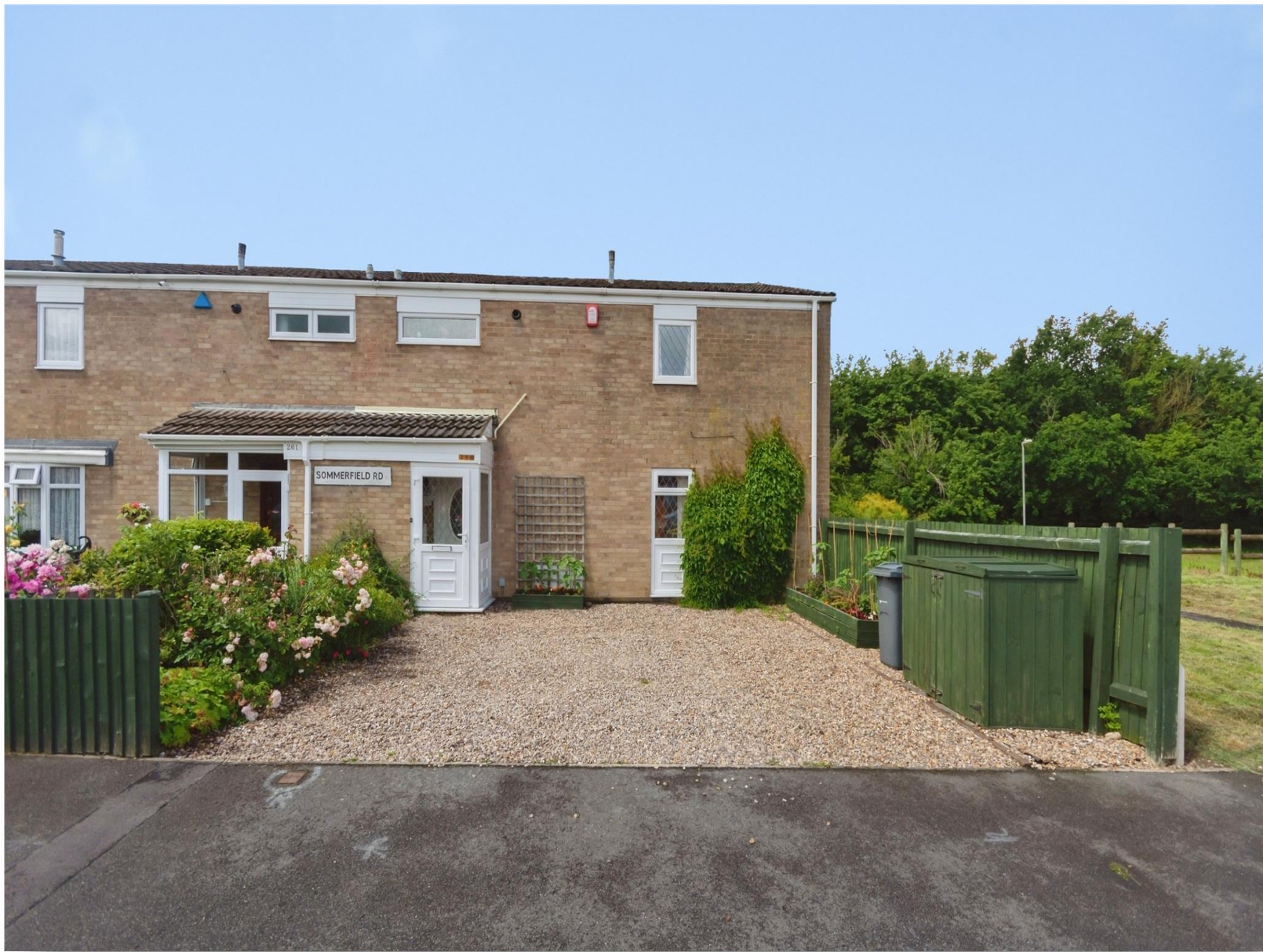
Sommerfield Road, Birmingham B32 3TB