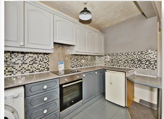
Tudor Court, Manor Road, Yeovil, BA20 1UP