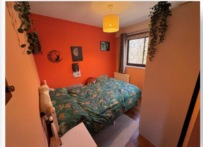
Ivel Court, YEOVIL, BA21 4HX