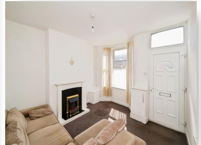
Greenwood Lane, Wallasey CH44 1DN