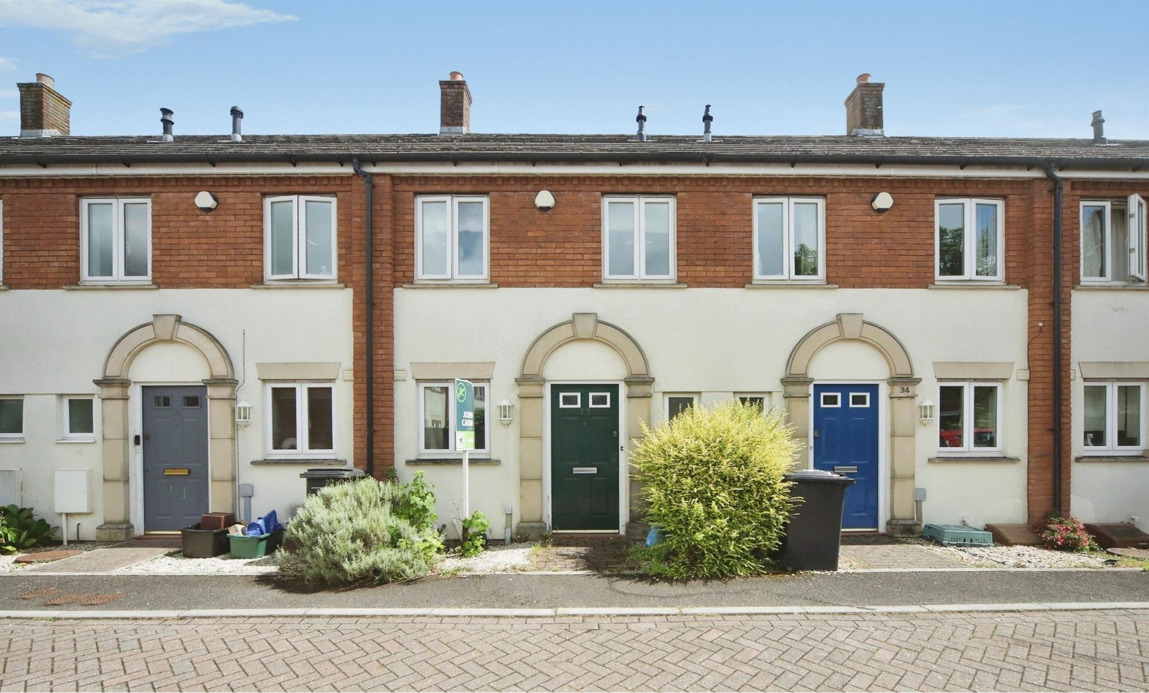
Mitre Court, Taunton TA1 3ER