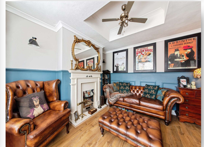
Chestnut Street, Ruskington Sleaford NG34 9DL