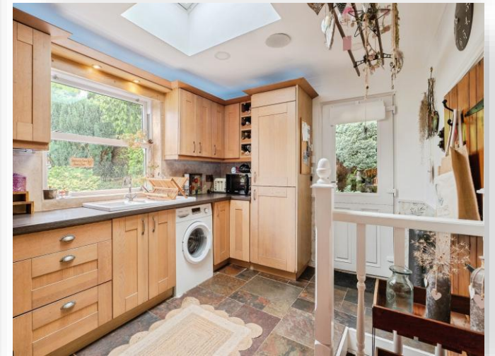
Burtens Lane, Swannington, Coalville