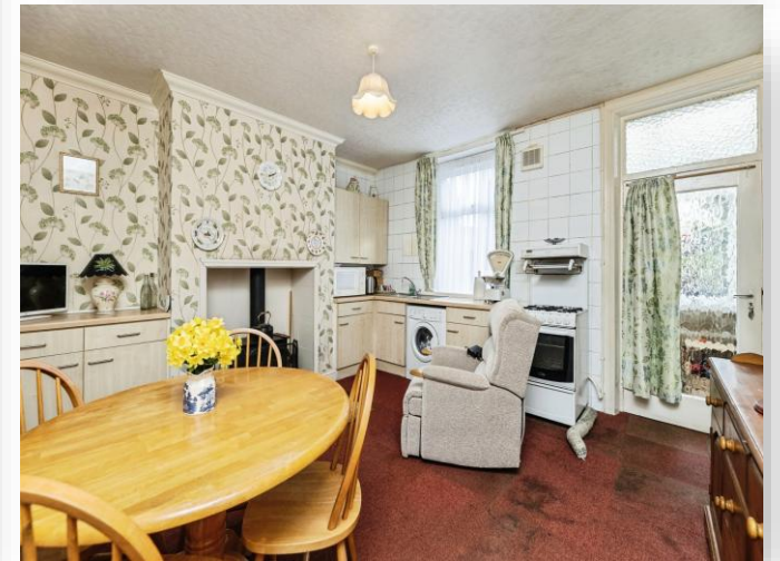
Queen Street, East Ardsley Wakefield WF3 2BE