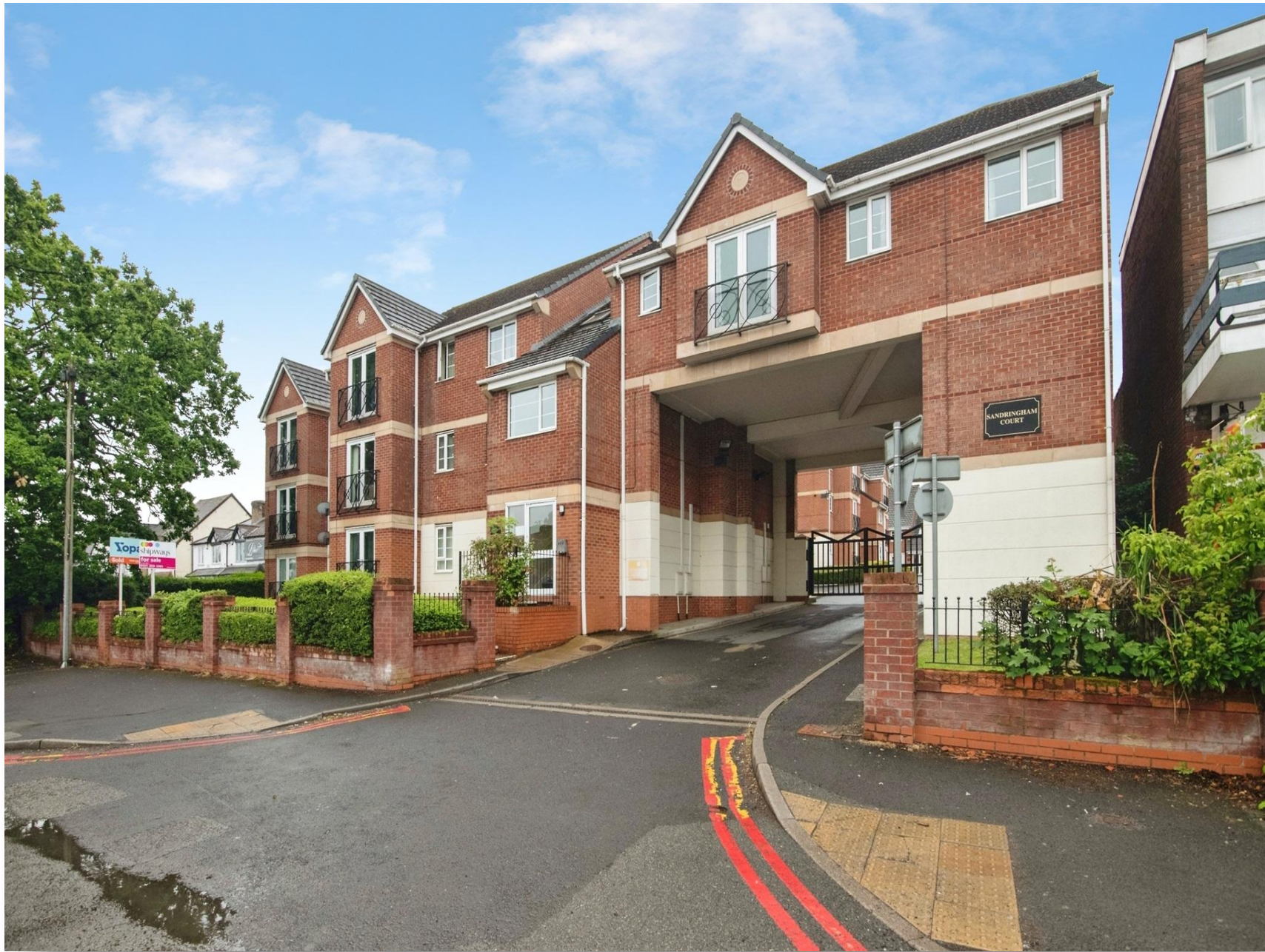
Sandringham Court, Great Barr Birmingham B42 1TF