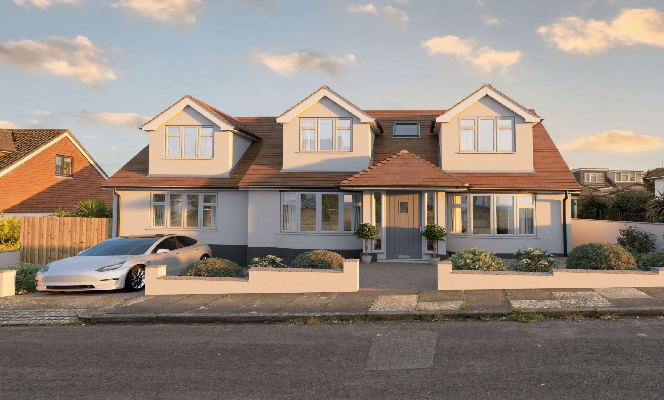
Baywood Gardens, Brighton, BN2 6BN