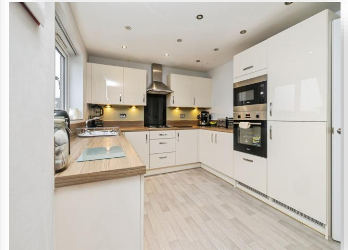
David Todd Way, Bardney LINCOLN LN3 5DN