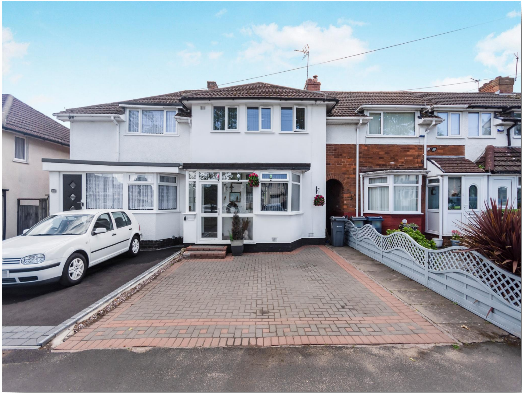
Highters Heath Lane, Birmingham B14 4PB