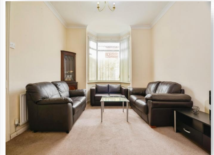
Camelon Street, Thornaby Stockton-On-Tees TS17 7HU